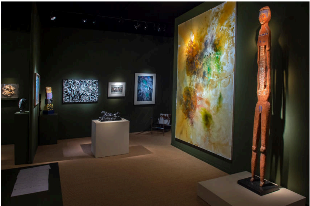
BRAFA 2022 - Galerie Schifferli

Mirroring this evolution, BRAFA must refine its concept. There is a strong desire to remain varied and diverse, but there is also a market trend that is increasingly focused on modern and contemporary art. We are very attentive to all these elements and we want to maintain a balance.